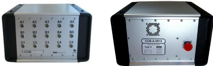
Cable Connector Box(CCB) – front and back