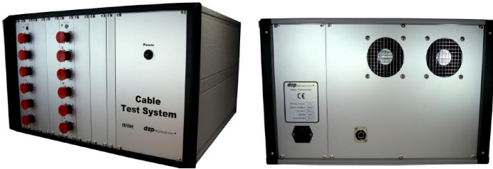
Cable Test System (CTS) – front and back